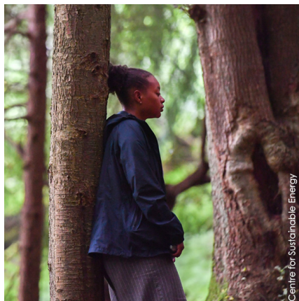
Centre for Sustainable Energy

Project managers report that Our Bright Future funding has been instrumental in supporting delivery organisations to upskill staff . Skills development has reflected the programme outcomes and brought together the youth work and environmental sectors . At a programme-level, SLI has enabled organisations to develop specialist skills related to youth work (e.g. non-confrontational behaviour management). Some organisations are working in this area for the first time and this expertise is, in turn, influencing organisational policy and practice relating to young people.